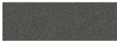
Graphite Grey Textured QC9821