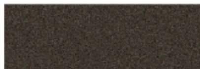
Sepia Brown Textured QC9798