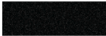
Ebony Black Textured QC9822