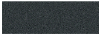
Deep Grey Textured QC9999