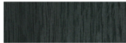
Blackened Wood 18-0249